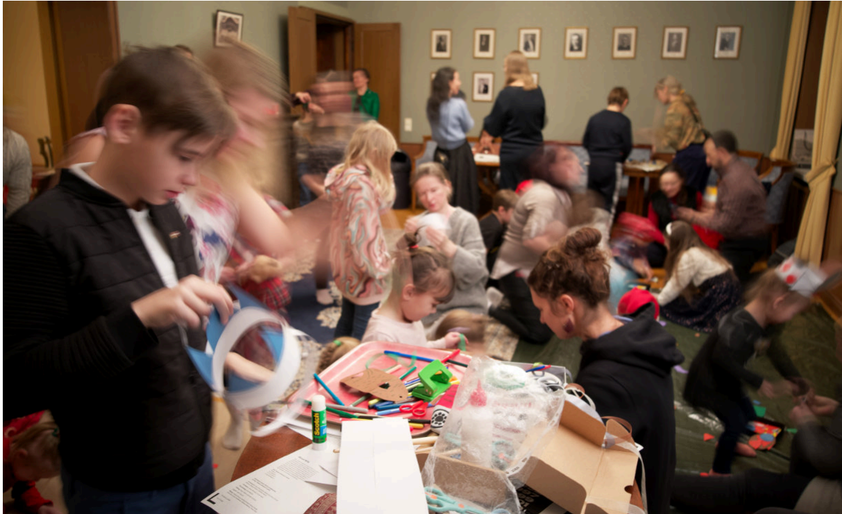
The traditional Christmas celebration for diaspora children at the embassy in 2022.