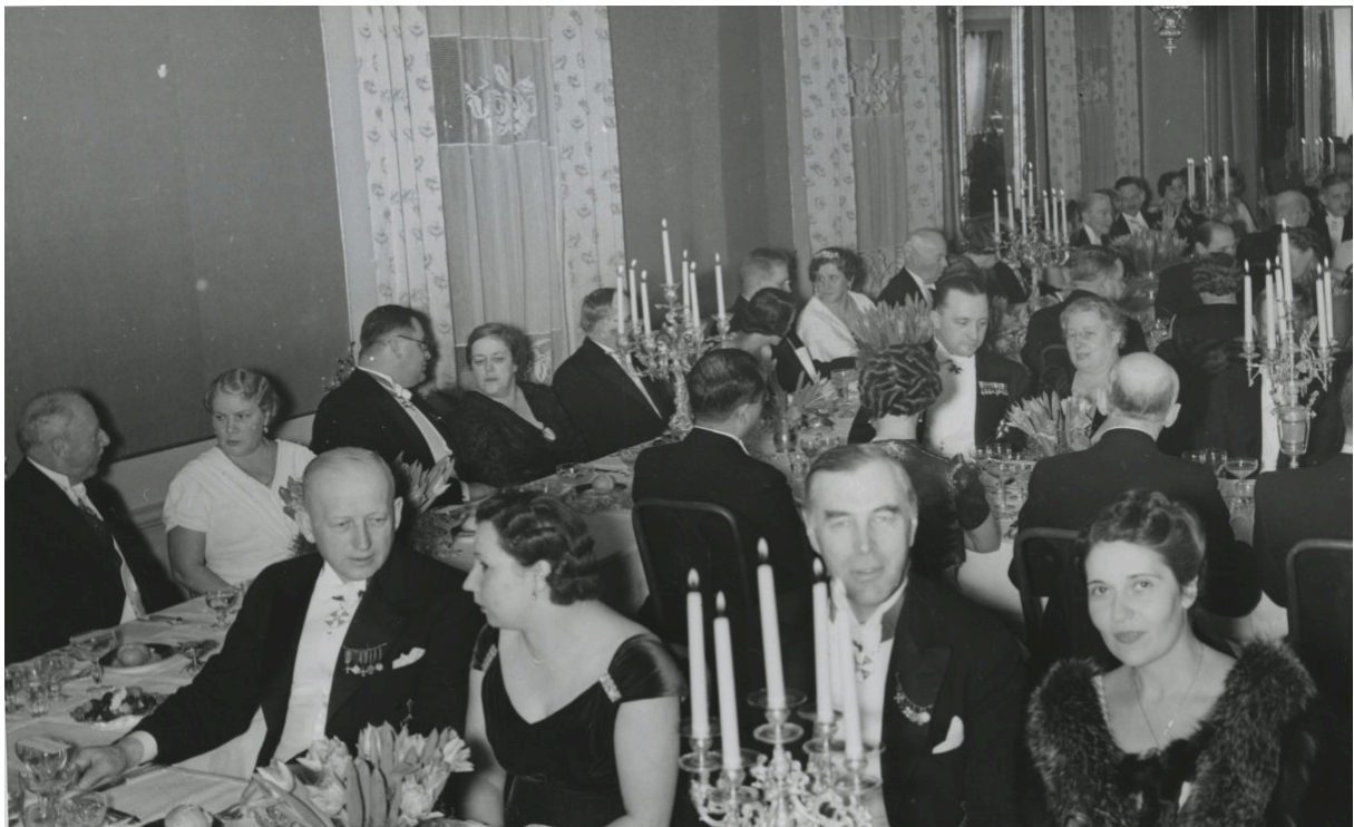
A dinner in Helsinki by the Minister of Foreign Affairs of Finland Eljas Erkko. The ambassador Tepfers is in the middle.