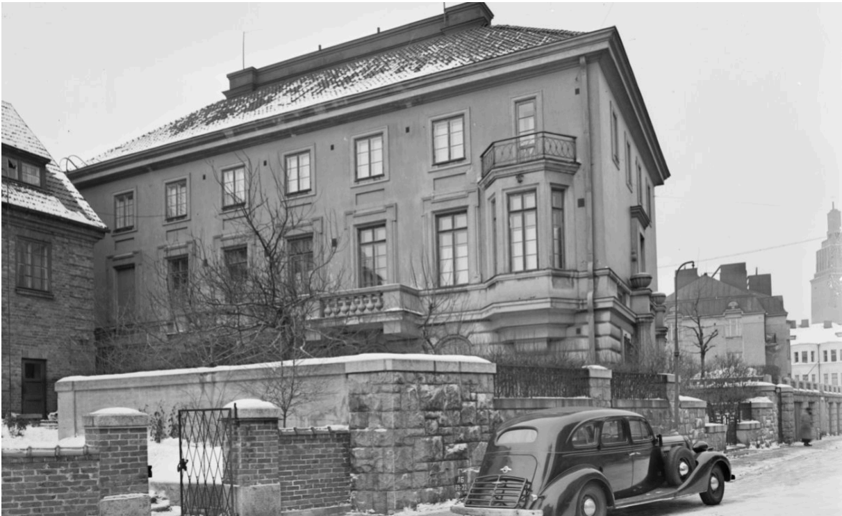
In 1946, a ZIS 101 series vehicle, displaying a license plate from the USSR (specifically Leningrad), parked in front of the embassy building. These particular cars enjoyed popularity among esteemed KGB officials. Notably, the windows of the building are obscured. The person standing by the gate is probably a Chekist. Additionally, the spire of the Agricola church is drawn in, reducing the risk of recognition from the air.