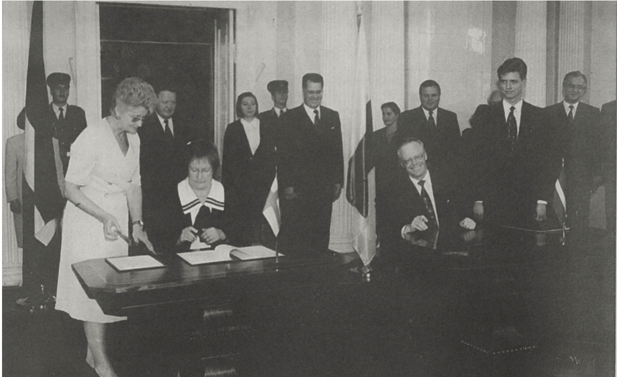
The Minister of Foreign Affairs of Finland, later President Tarja Halonen, and the Minister of Foreign Affairs of Latvia Valdis Birkavs sign the agreement on the transfer of the ownership of the land and building to Latvia in 1995.