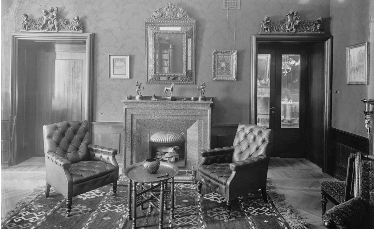
Villa Frenckell. Photograph: 1924, Eric Sundström, Helsinki City Museum.