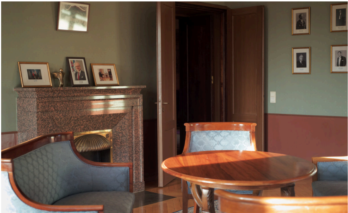
Representation premises of the embassy. In the background, a fireplace made of Hanko granite.