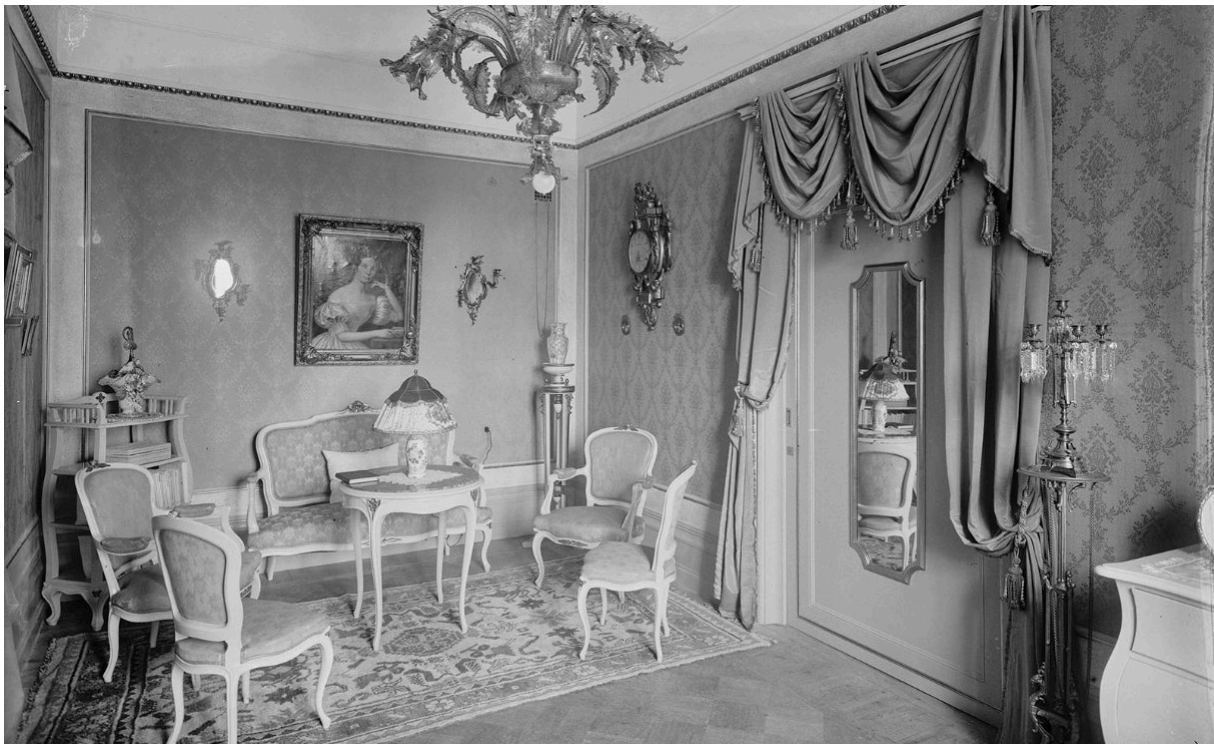
Villa Frenckell. Photograph: 1924, Eric Sundström, Helsinki City Museum.