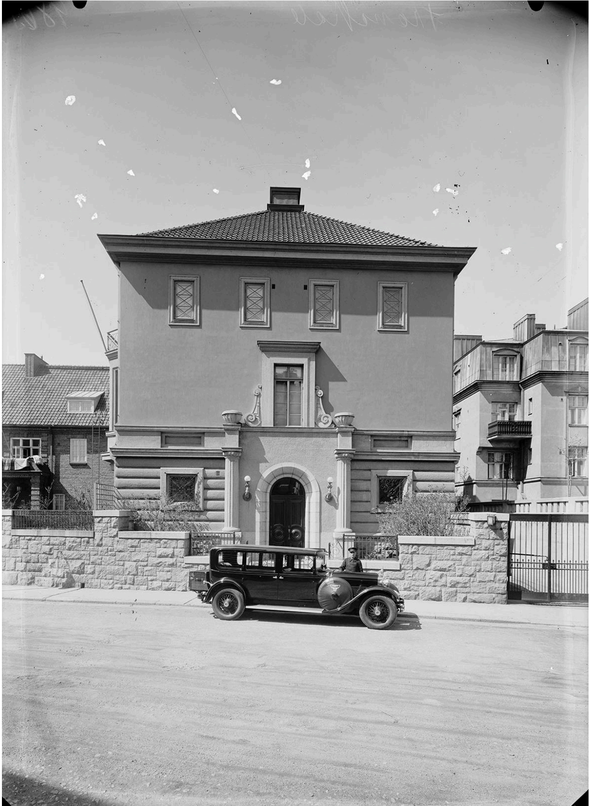
Villa Frenckell. Photograph: 1929, Eric Sundström, Helsinki City Museum.