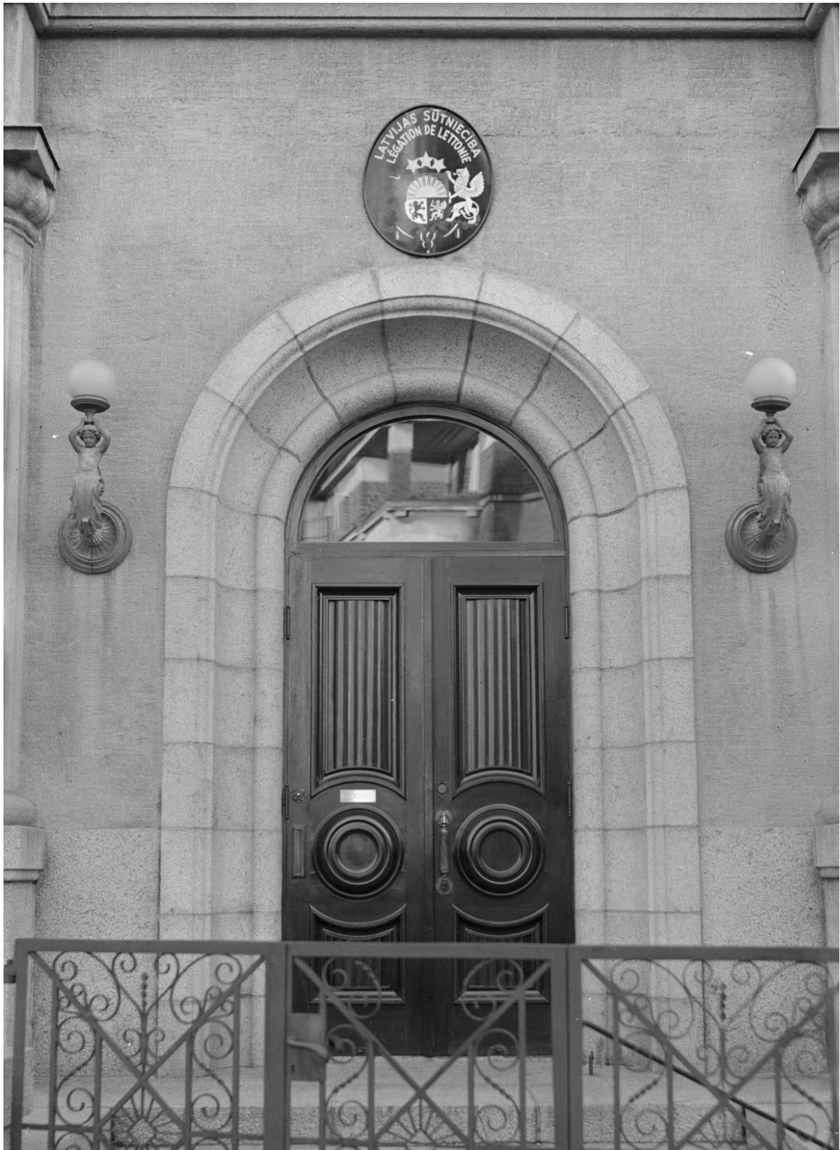
The grand entrance doors of the embassy building in 1934. These very doors continue to serve dutifully all the users.