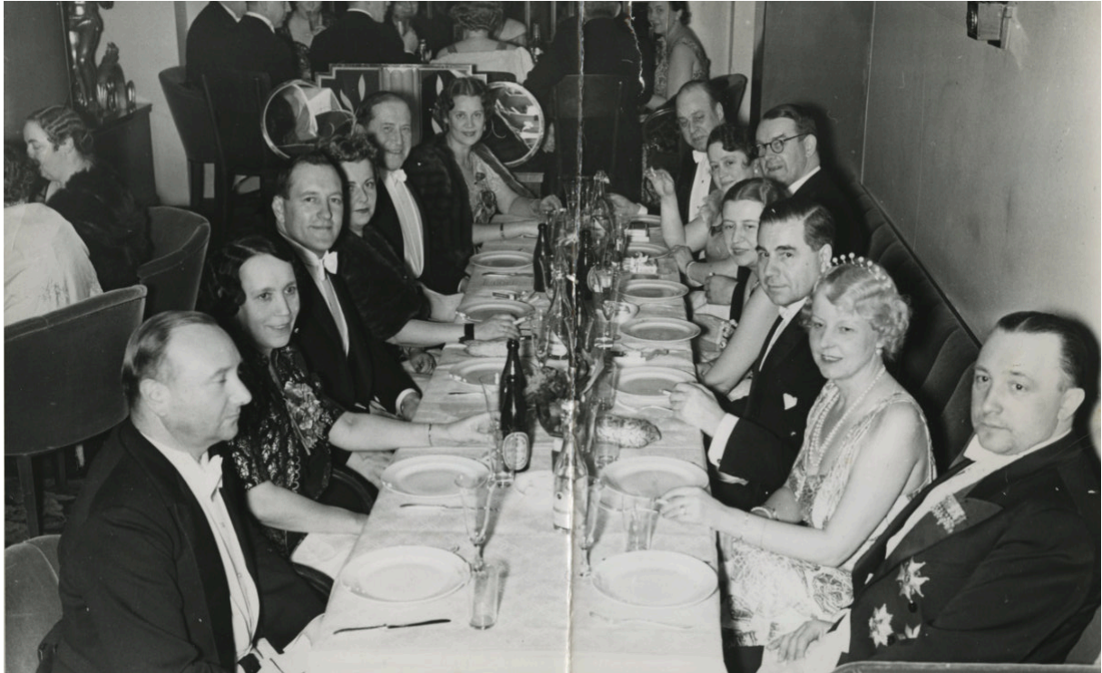
The first on the right: the last Ambassador of Latvia to Finland before the WWII, Jānis Tepfers. The Red Cross Ball in February 6, 1939.