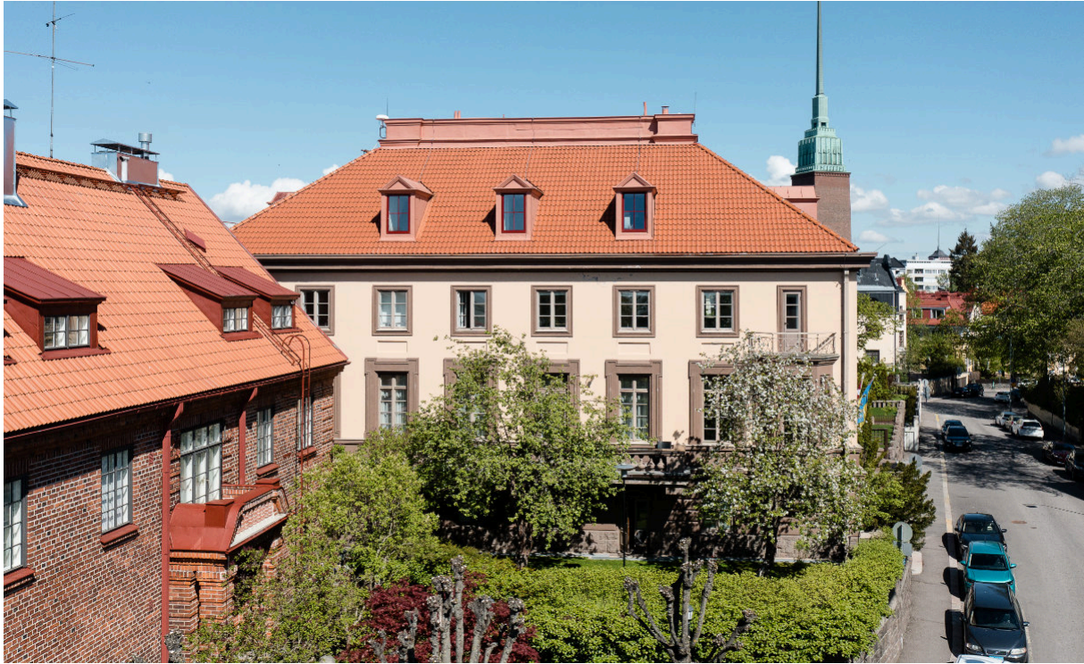
Embassy building in June 2022. In the background, Mikael Agricola Church. The Soviet Union, during the mid-1960s, embarked on a mission to construct a new trade mission headquarters in Helsinki, marking a pivotal moment in the story of Villa Frenczell. The Soviet Union had a vision of erecting this new building in the heart of the city, right next to their embassy, on a plot of land owned by Finland on Tehtaankatu Street.