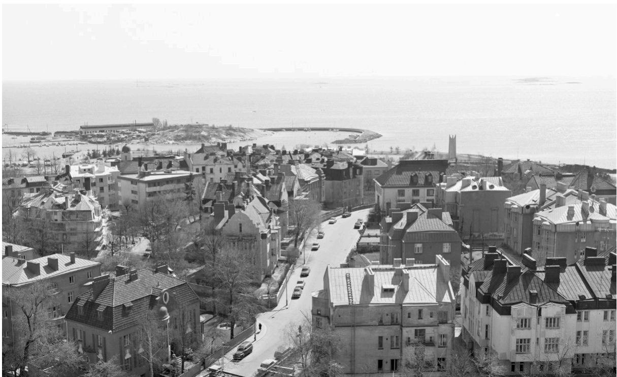
Armfeltintie street as seen from the observation deck of the Micael Agricola church tower. The image reveals the attic windows on the top floor of the building. Photograph: 1972, Kari Hackley, Helsinki City Museum Archive.