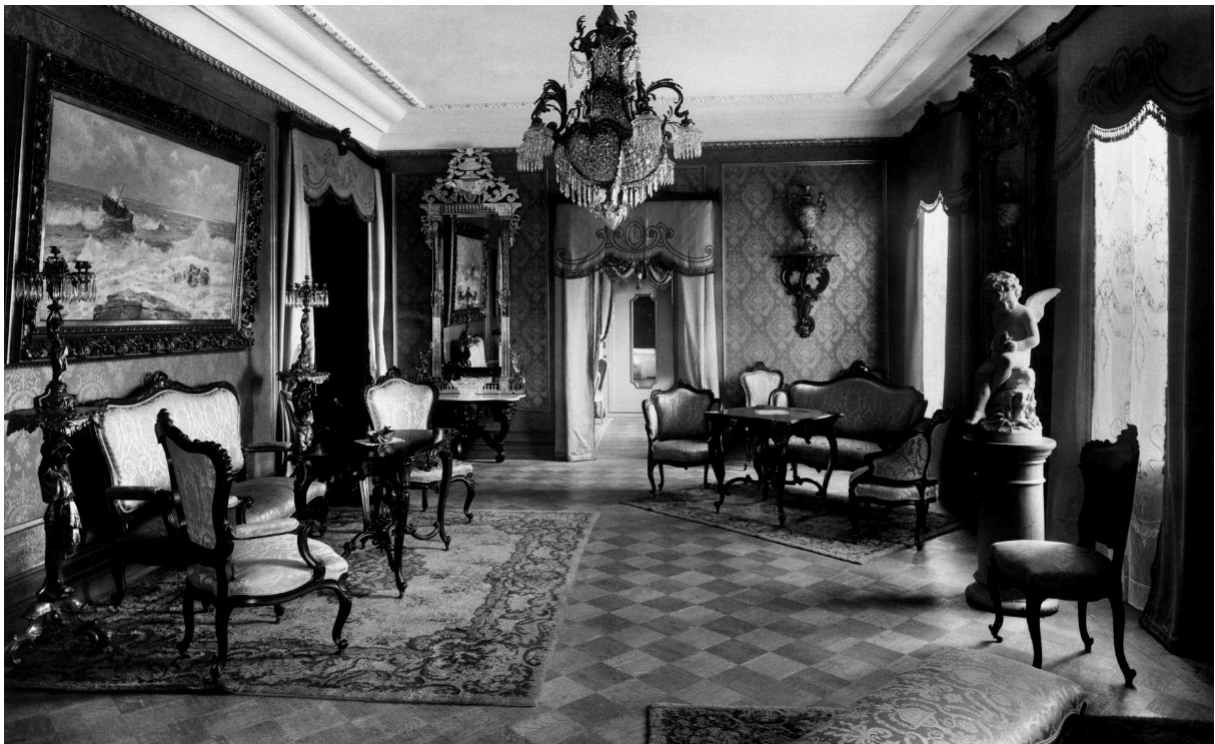
Photograph: 1924, Eric Sundström, Helsinki City Museum.