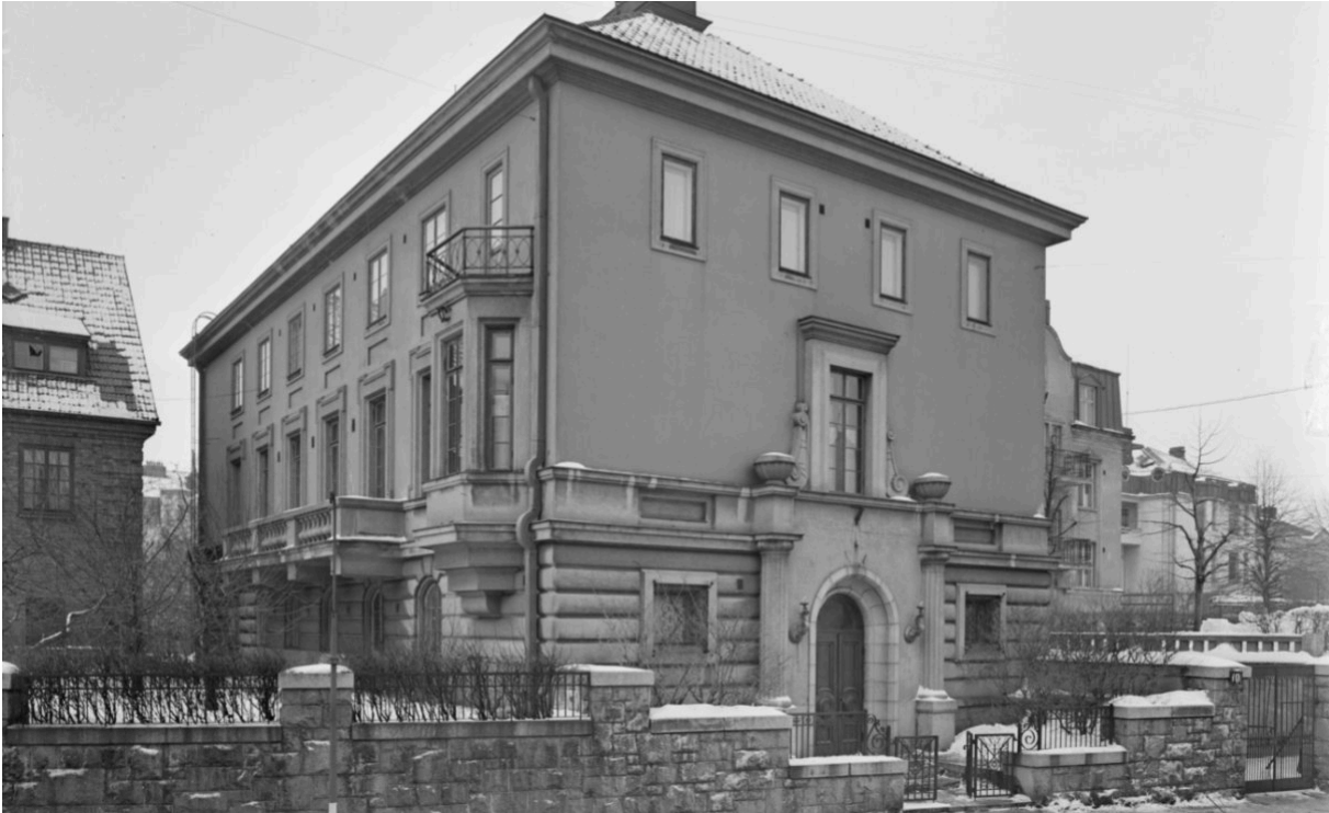
The embassy building in February 1946.