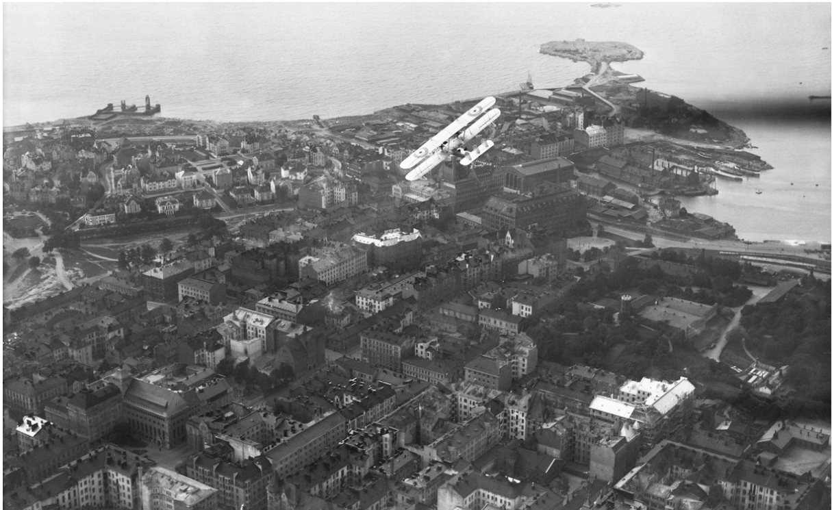
Eira, aerial photo 1930.