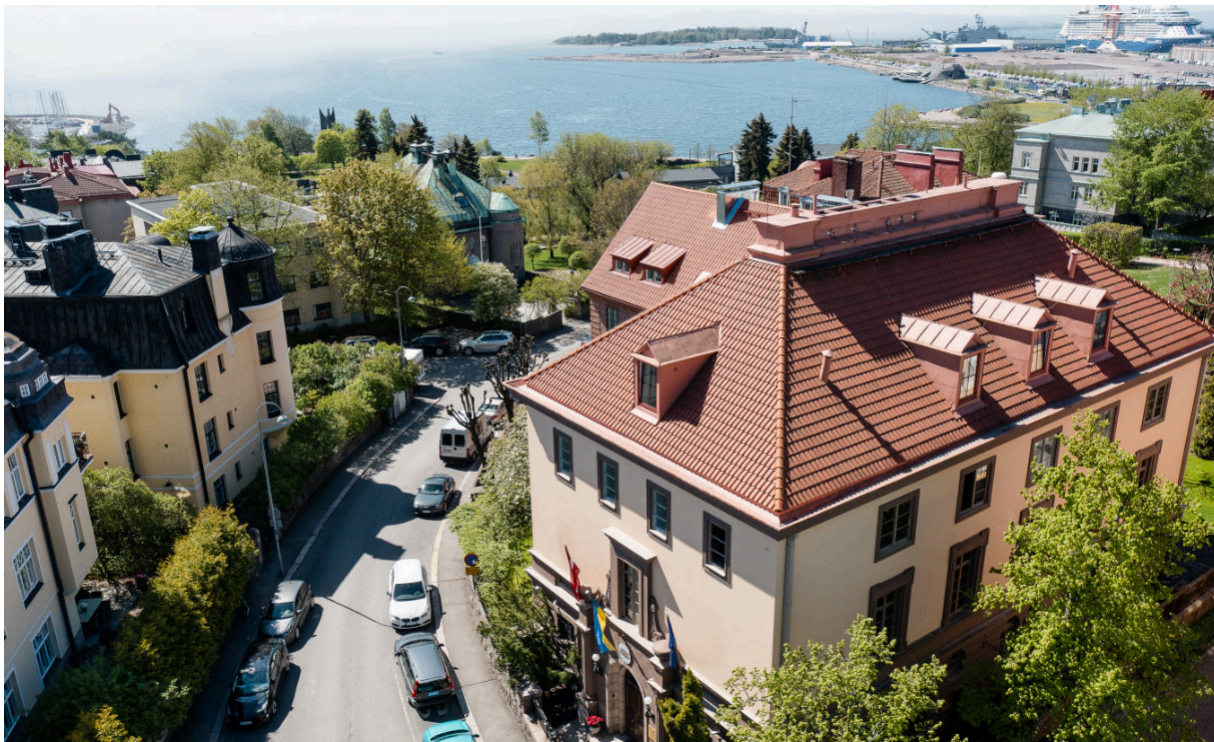
Eventually, in 1966, an agreement was reached: Finland would grant the coveted land to the USSR in exchange for three properties - the Latvian embassy building, the Estonian embassy building, and a house in the Töölö district acquired from Germany as part of the reparations process.