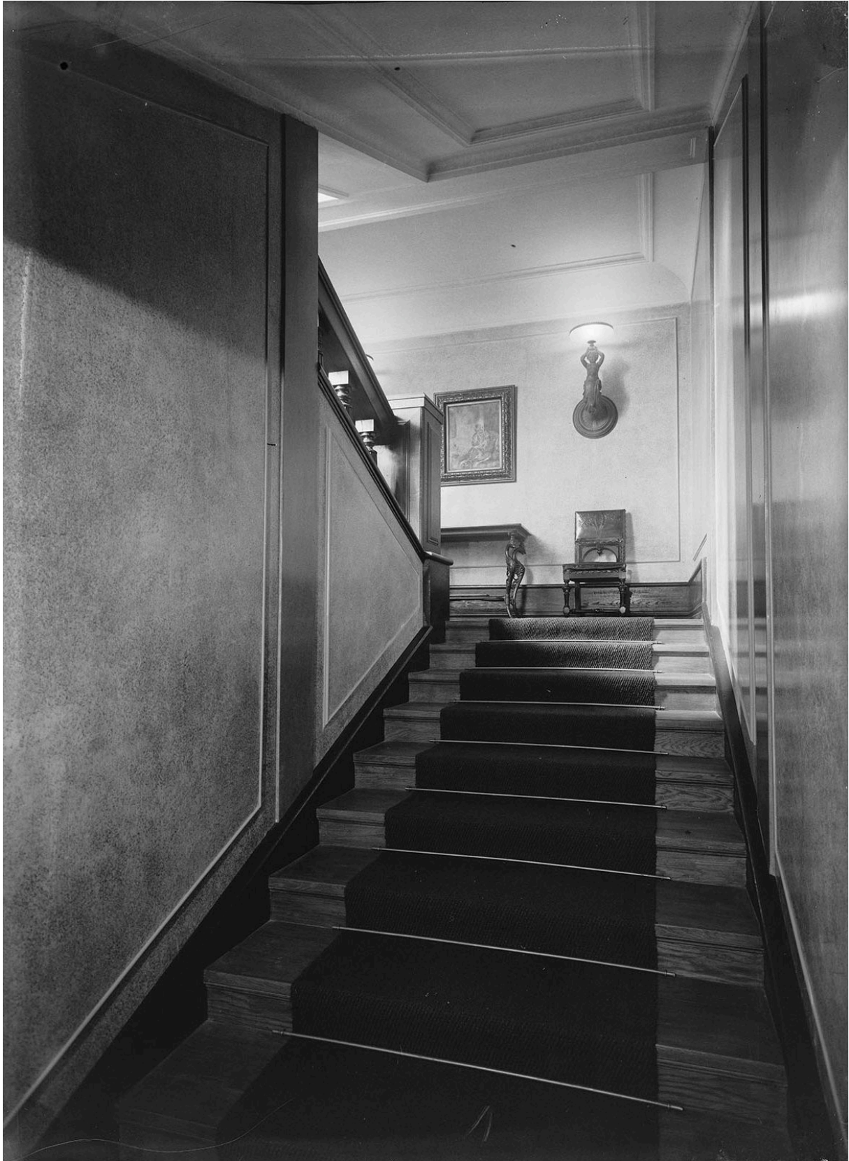
Villa Frenckell. Photograph: 1924, Eric Sundström, Helsinki City Museum.