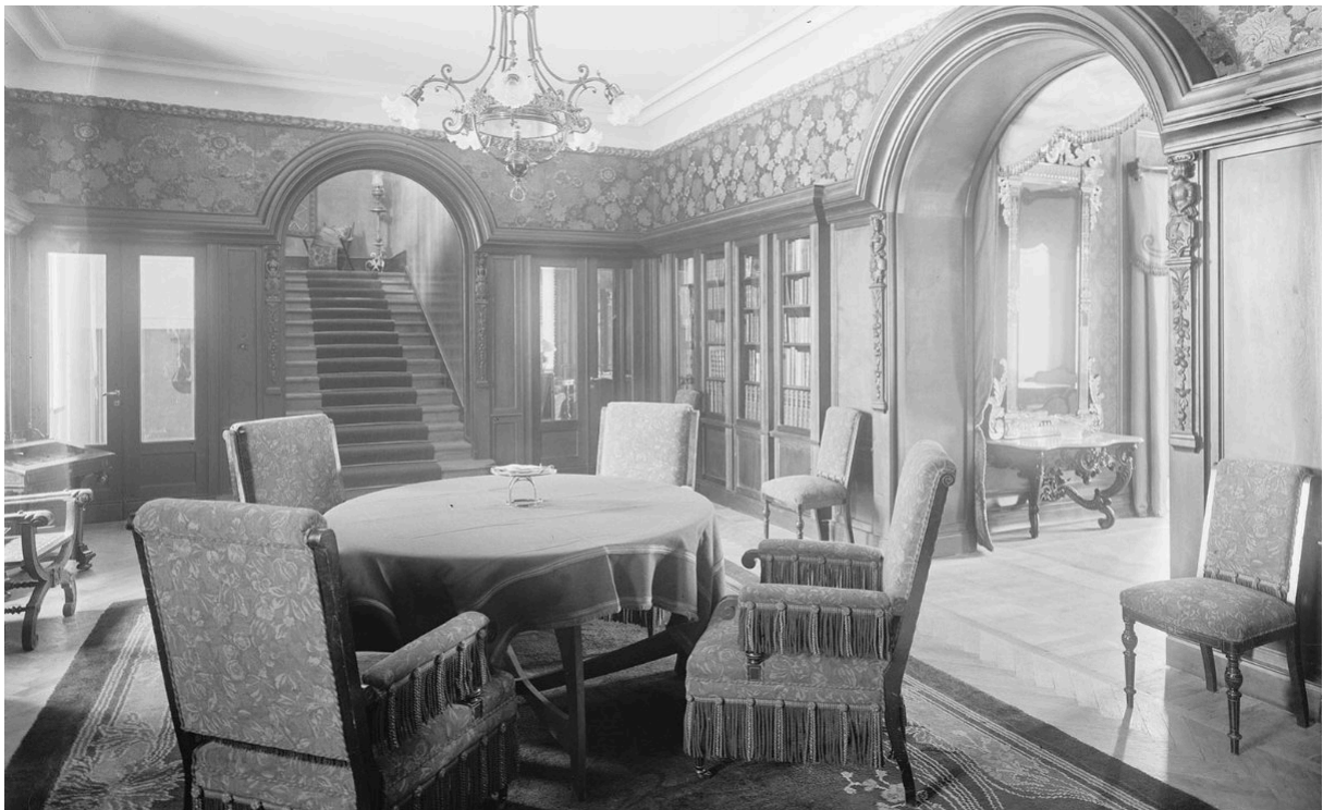
Villa Frenckell. Photograph: 1924, Eric Sundström, Helsinki City Museum.