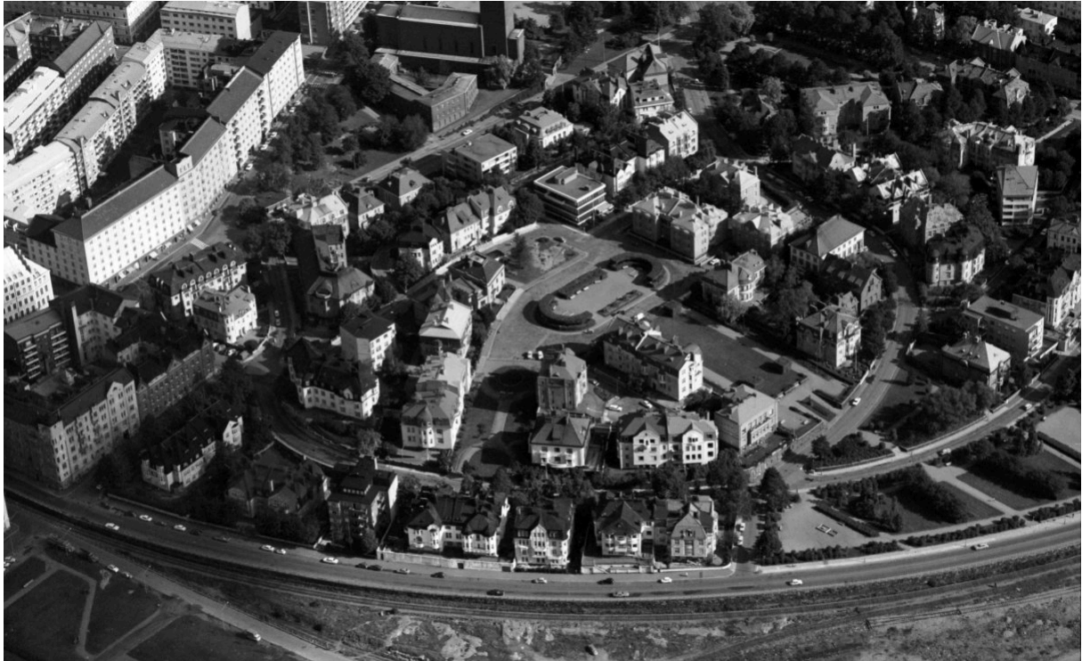
Aerial photograph of Eira in 1970.