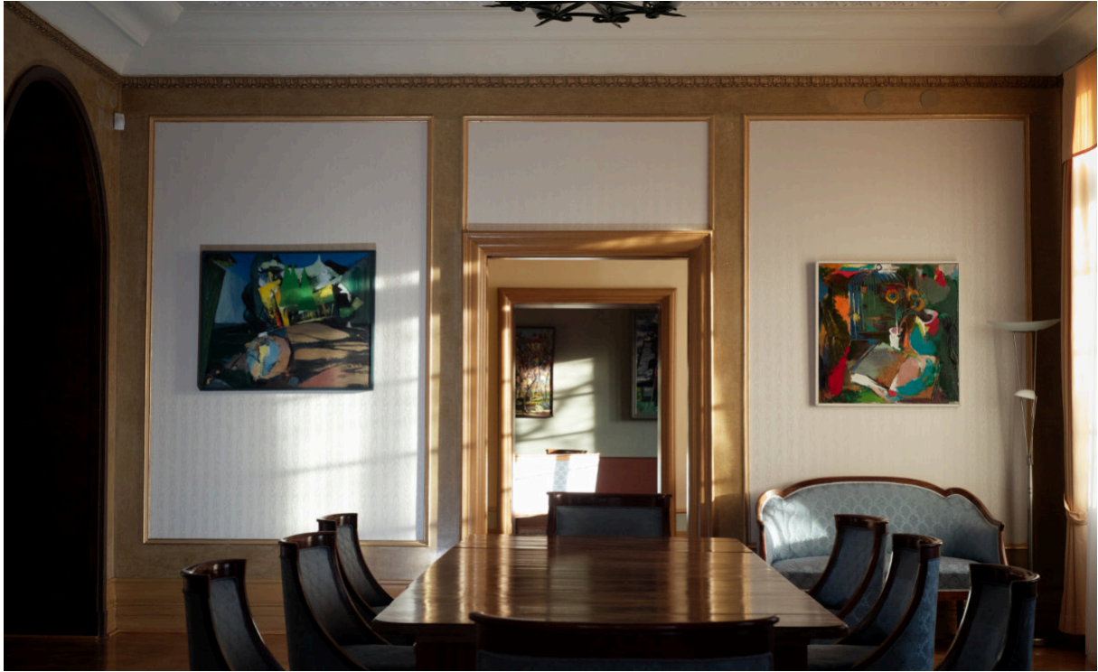
Representation premises of the embassy.