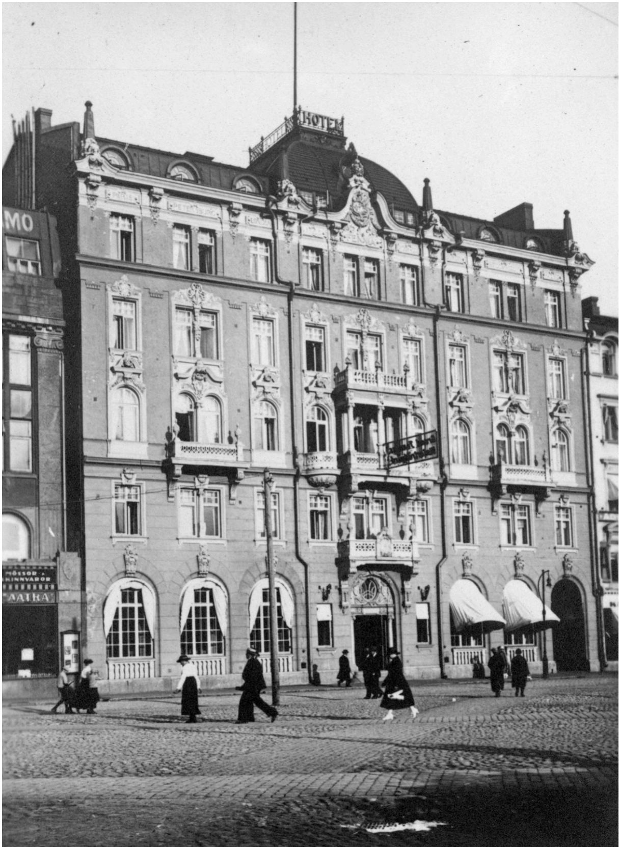
Hotel Fennia at the Helsinki Station square, Mikonkatu 17, in the first half of the 19th century. The Latvian envoy worked in the hotel premises between 1919 and 1921.