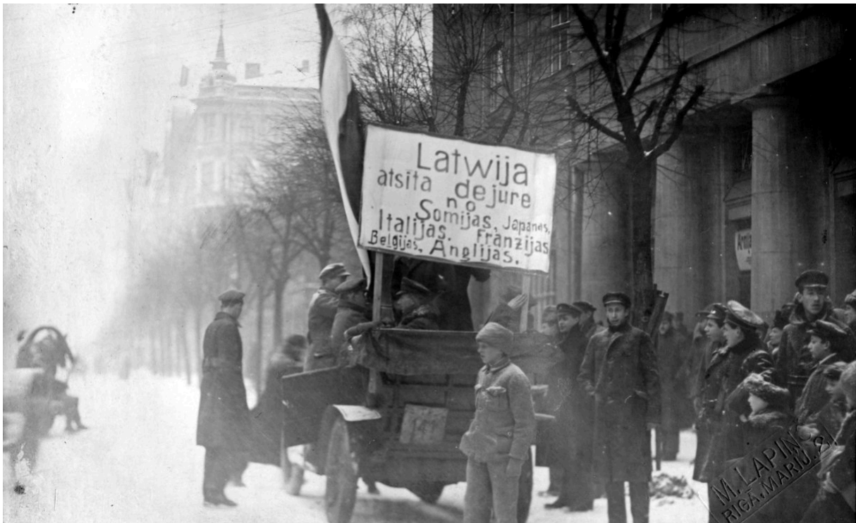
A poster displaying the names of the nations that officially recognized Latvia's sovereignty, Finland being among them, attached to the car on Nikolaja Street (now Kr. Valdemāra Street 10/12) in Riga. Photo: 1921, Mārtiņš Lapiņš, National Archives of Latvia.