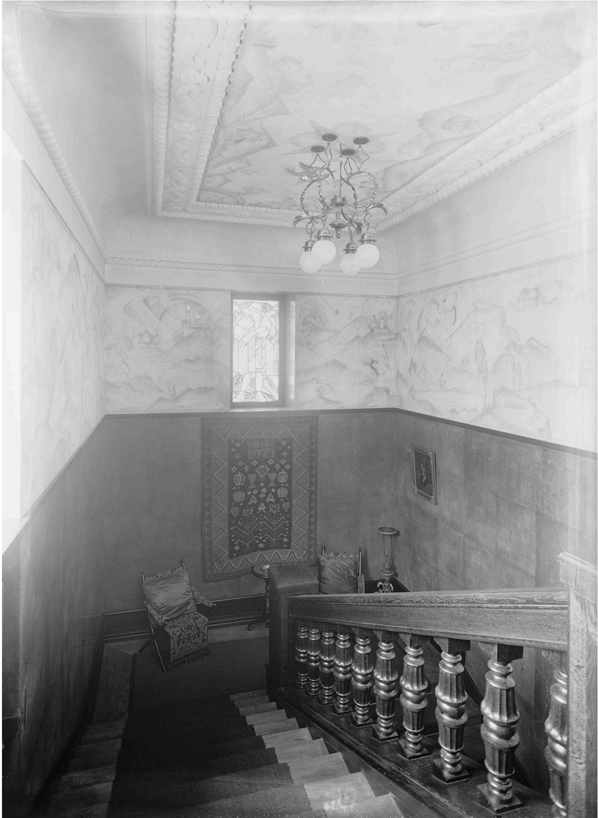
Villa Frenckell. 1924.