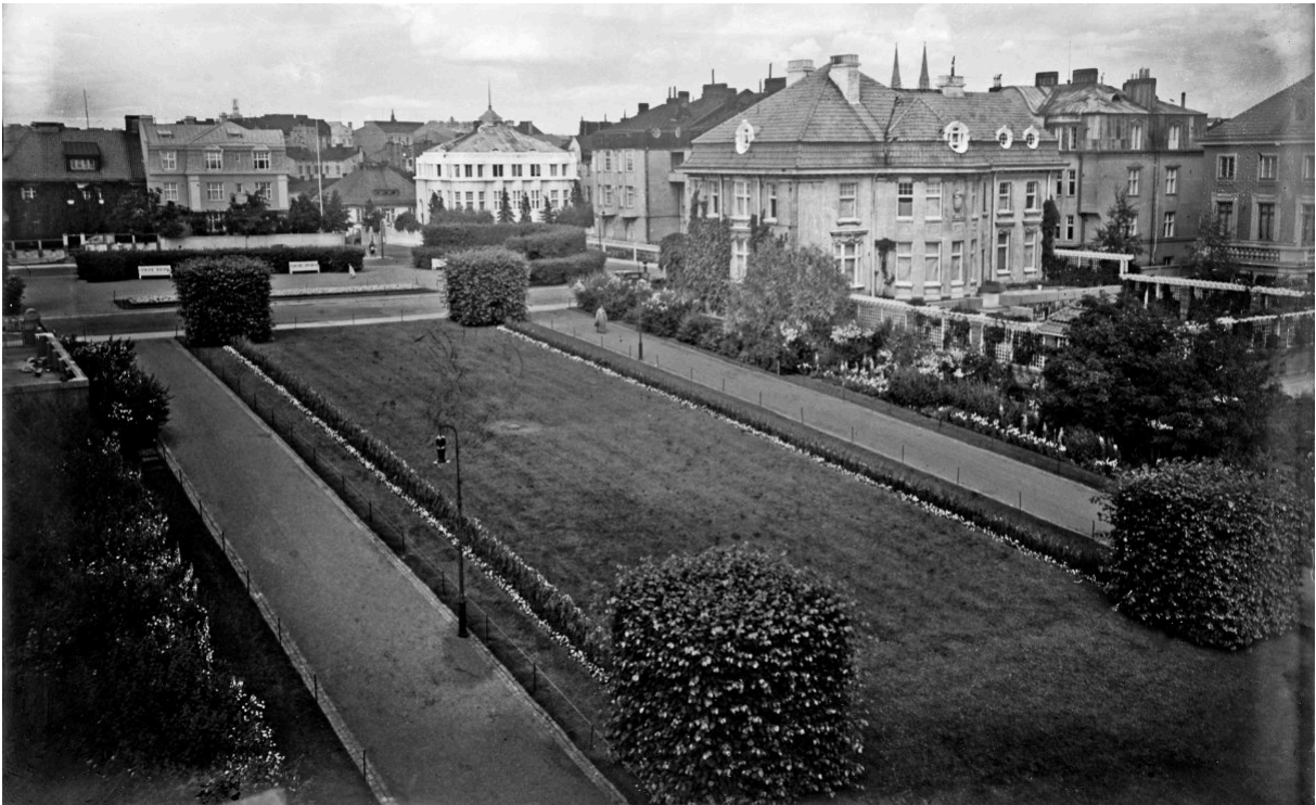
The famous square Engelin aukio and park Juhani Ahon puisto near the embassy. The picture shows the courtyard terrace of the embassy building. 1936.