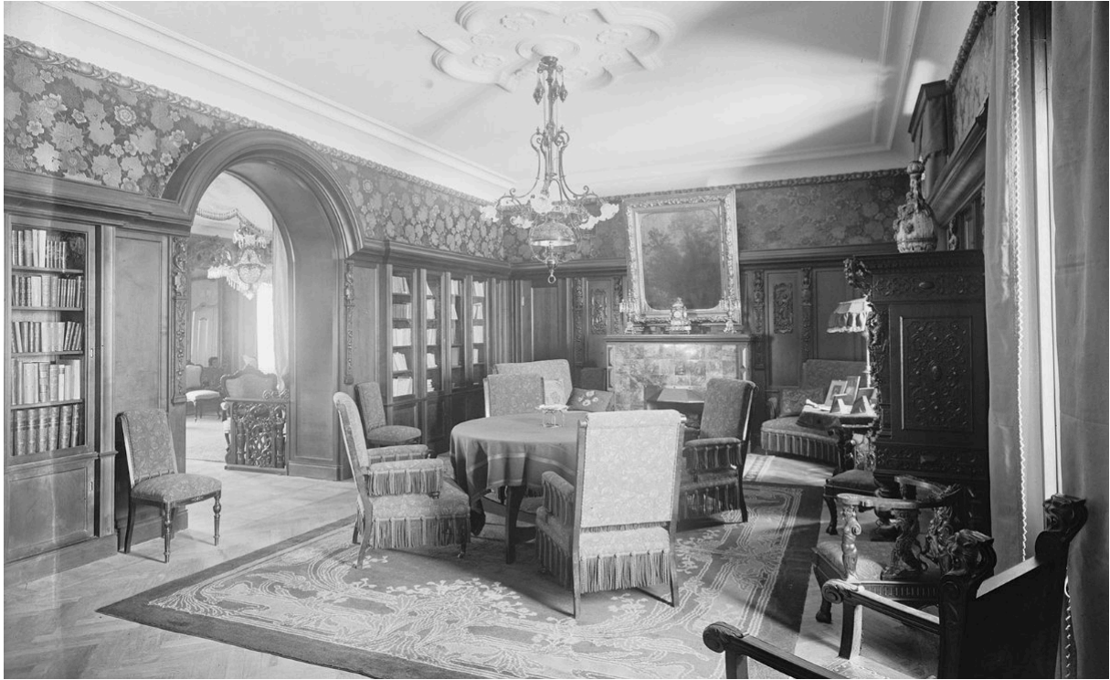
Villa Frenckell. Photograph: 1924, Eric Sundström, Helsinki City Museum.