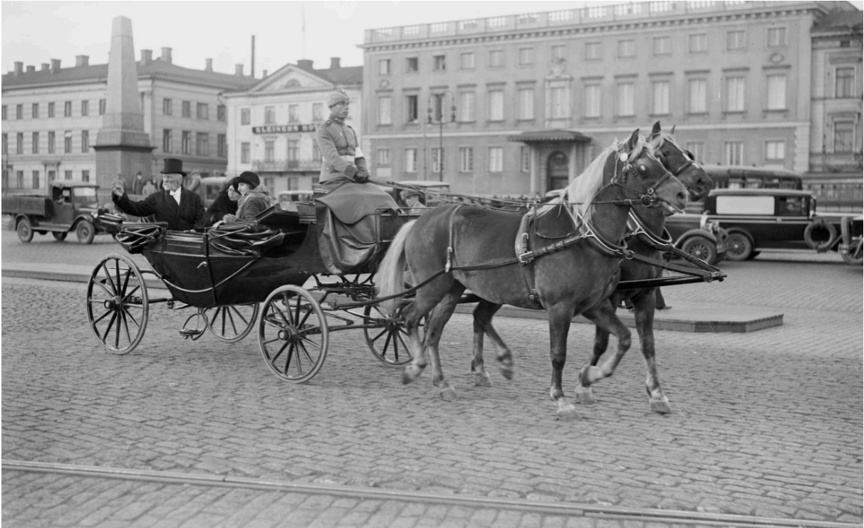
President of Latvia Jānis Čakste visiting Helsinki in 1926.