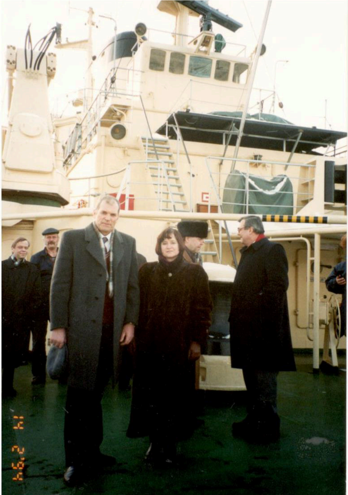
The winter of 1994 was harsh, the Gulf of Riga froze over, and Latvia purchased the icebreaker Varma from Finland. The ship, built in Finland in 1968, served for a long time in the Riga Freeport fleet, and its port of registration was Riga.