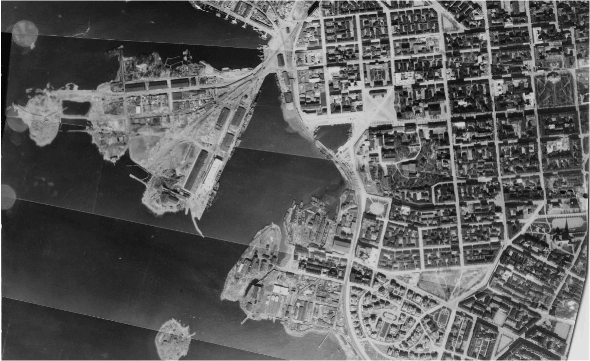
The earliest aerial photo showing the embassy building, 1924.