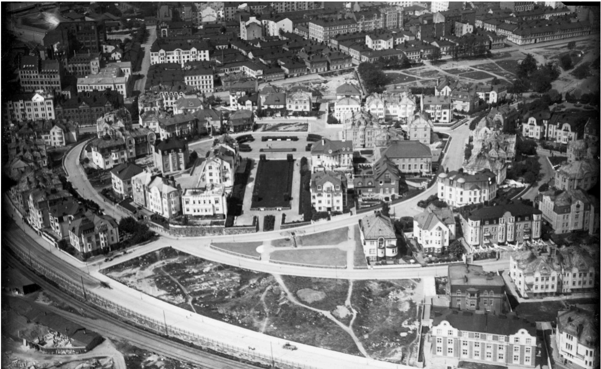
Villa Frenckell is situated in the Eira district of Helsinki, renowned for its Art Nouveau residential development during the period of 1907 to 1915. This district derived its name from the nearby Eira Hospital, which itself was named after the Norse healing deity. Eira Hospital, designed by architect Lars Sonck, was among the earliest structures constructed in Eira, dating back to 1905. Photograph: 1925, Rauhamaa, Helsinki City Museum archive.