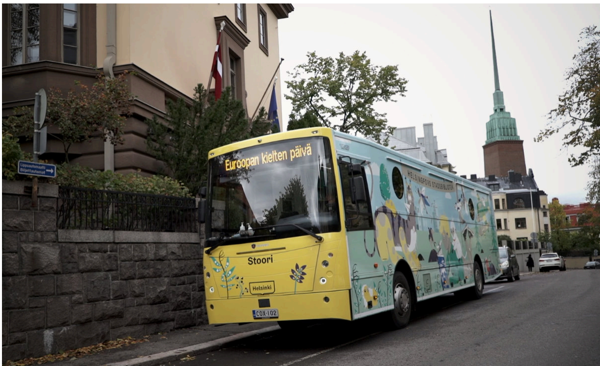
European Language Day at the embassy of Latvia in Finland, Helsinki in September 2021. The library bus has brought the entire collection of modern Latvian literature that is expanded every year.