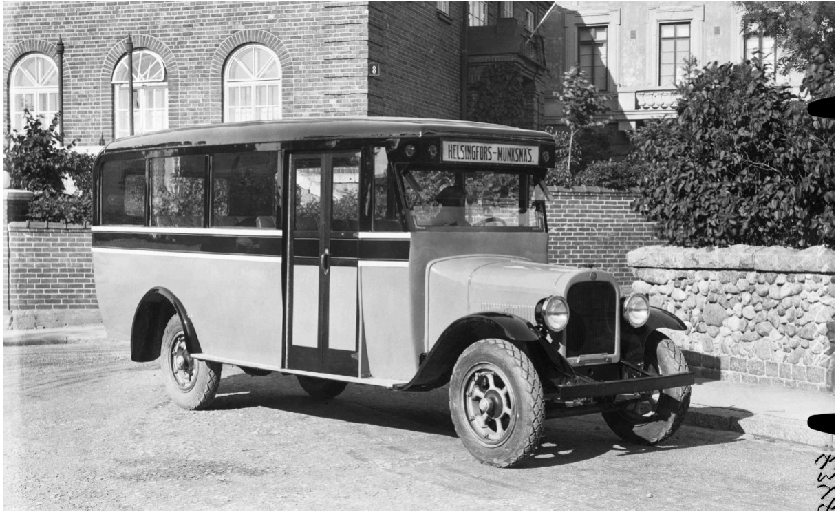
A service bus at the junction of Armfeltintie 8 and 10. 1927.